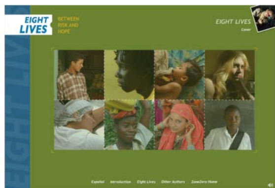
Figure 1. Eight Lives website

Eight Lives is another writing activity involving the redesign of an available text. This time students were asked to write a self-introduction by paraphrasing one of the short essays of a photo exhibit by the Argentinian photographer Diego Goldberg ( www.zonezero.com ).