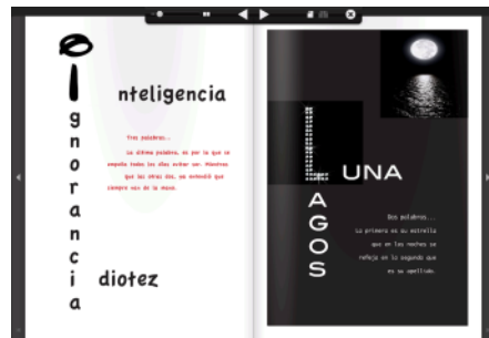
Figure 4. Redesigned "A-Z Guide", published in ISSUU