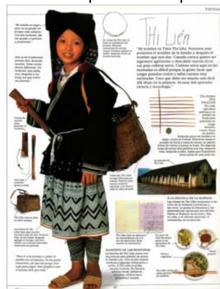
Figure 5. Children just like me , original (paper) book

In this assignment students were asked to redesign a page of the book Children just like me (Kindersley & Kindersley, 1995) (Figure 5) about the dreams, beliefs, hopes, fears and everyday life of children around the world. The author positioned a photo of one child in the centre of each page and assembled significant objects and places and texts around it. Again, students were asked to use the original design and personalize the content through pictures of themselves, their favorite toy, pet, house, and other significant items (Figure 6) using image-editing software, such as GIMP or Photoshop.