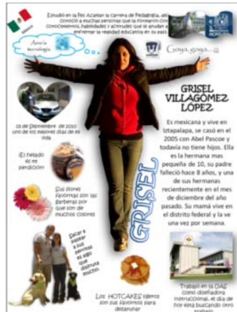
Figure 6. “Children just like me”, redesigned (digital) text

The assignment afforded the creation of new connotations for images shot at varied times and places as they were relocated into a context. By cropping and resizing the images, assembling them with texts and juxtaposing them with other images and graphic elements, the students became aware of the meaning potential inherent in multimodal representations. The assignment allowed students to re-present themselves and their ordinary life within a new symbolic context. Just as Fernanda (see her Eight Lives assignment above) students expressed a sense of joy and confidence as creator of their own representations of self. See, for example, Teresa’s final comments about the course: