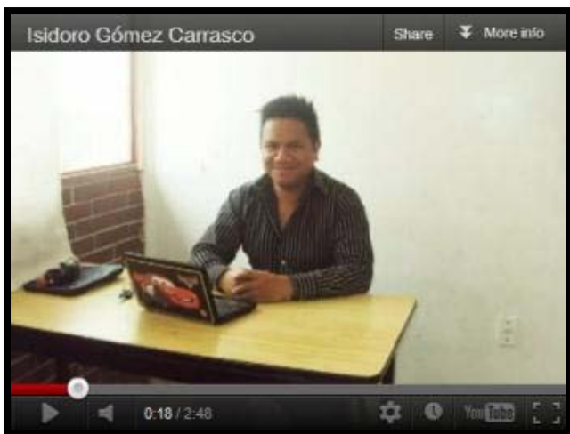
Figure 9. Isidoro's digital story uploaded in YouTube

By adding his voice, something different became apparent: the text stopped being a